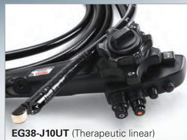
EG38-J10UT (Therapeutic linear)

The PENTAX Medical Ultrasound Video Gastroscope EUS-J10 line-up is designed for optimized procedural efficiency. Together, Hitachi and PENTAX Medical provide brilliant imaging and unique features in a joint clinical solution. This combination allows for clear visualization, successfully enabling endosonographic diagnosis and advancing therapeutic procedures for the benefit of patients.