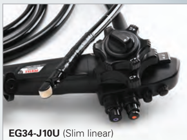
EG34-J10U (Slim linear)