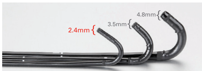
| Offering a portfolio of naso-pharyngo-laryngoscopes for your varied needs