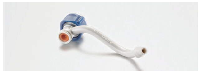
| Single-use Suction Control Valve